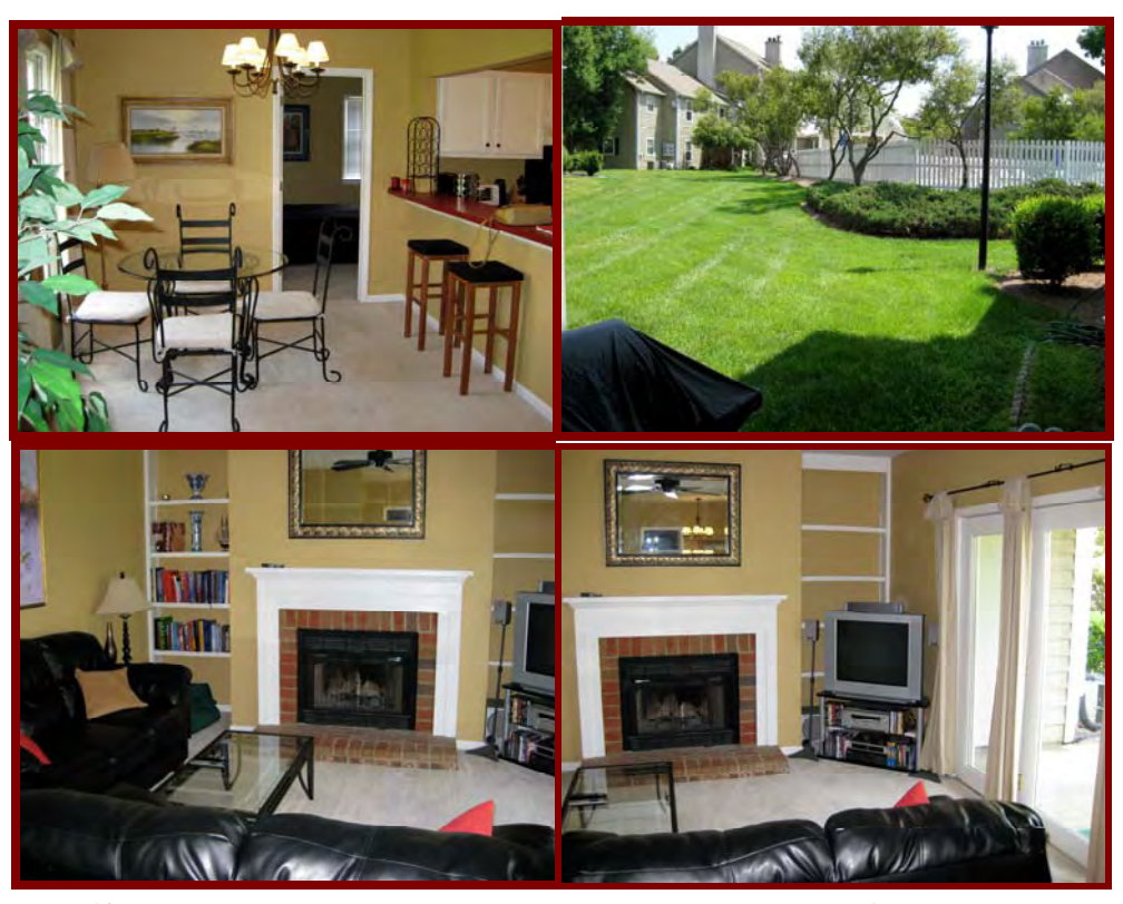
Selwyn Farms – Hunters Run Condos 3218 #1 Selwyn Farms Ln.

Immaculate & ready to move-into garden end unit. Large Living room with built-in book shelves & wood burning fireplace opens to patio. Large Master bedroom with walk-in closet. Second room is perfect for an Office/Den/2<sup>nd</sup> bedroom. Spacious Laundry room adds great storage space. Neutral colors. Private patio leads to great back area, perfect for play. Complex has fun pool and conveniently located to CMC, Southend & Center City. A must see!